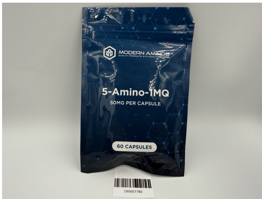
Photo of the test sample

The test sample was applied in the amount of 3 \mu l to the BioBasic 8 Thermo Scientific column. During the analysis with the method a linear gradient in the solutions of H 2 O and Acetonitrile with the addition of 0.1% trifluoroacetic acid, a peak of the sought substance appeared. Its concentration, when compared to the reference chromatogram, is 52,82mg/caps. The measurement error is + - 0,05mg. The actual state of the sample sent before the test is presented on the photo below